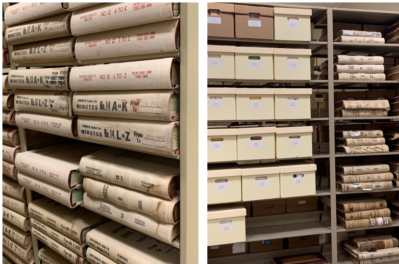
Images of collections at the Travis County Archives.

The Archives are, oddly, occupying space in the Travis County Sheriff's Building on Airport Blvd. while waiting for permanent space. Staff is happy to work with researchers by appointment. Ask about obscure County history . . . like the Travis County Poor Farm or lost communities. One was called "Mud" after its riverbanks.