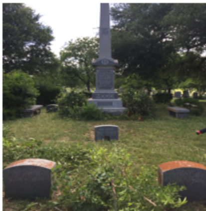
When we started