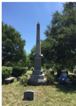
When we finished

Jamestowne Society genealogy has just gotten a lot more helpful