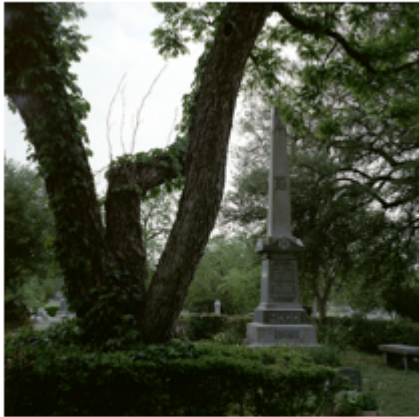
As it was years ago