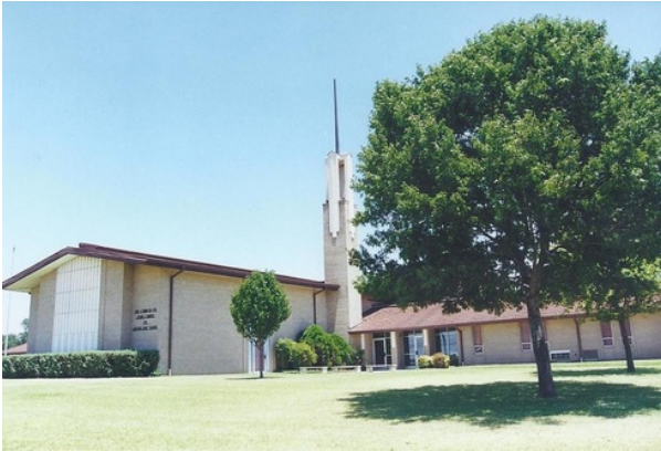
Austin Family History Center, 1000 E. Rutherford Lane

While at the Family History Center you have FREE access to the following databases: