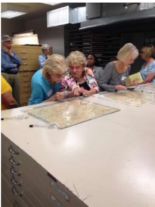
AGS members get a close up view of the maps in the collection.