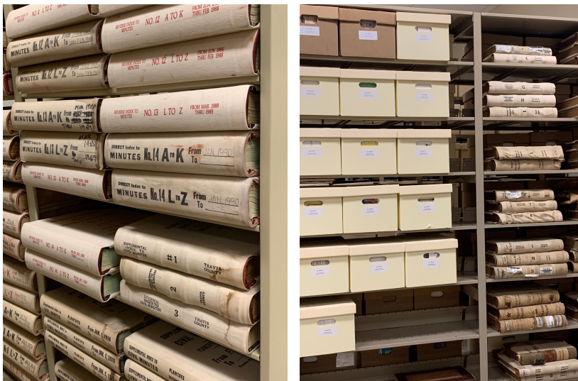
Images of collections at the Travis County Archives.

The Archives are, oddly, occupying space in the Travis County Sheriff's Building on Airport Blvd. while waiting for permanent space. Staff is happy to work with researchers by appointment. Ask about obscure County history . . . like the Travis County Poor Farm or lost communities. One was called "Mud" after its riverbanks.