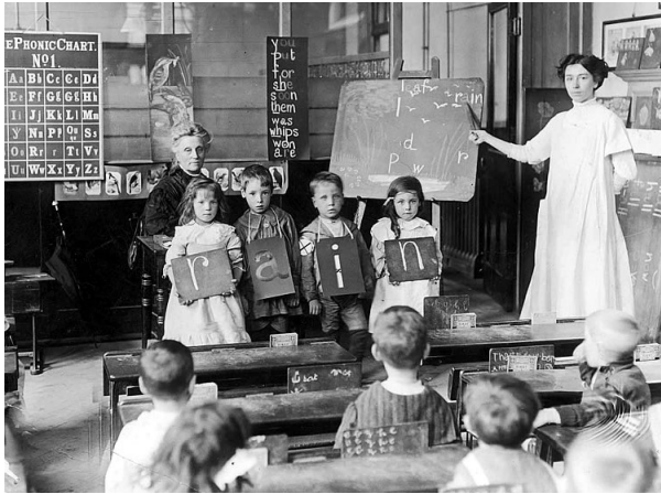
Spelling lesson, Chelsea England, 1912.

Information about our classes is available here . All classes are free.