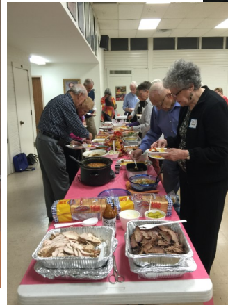
AGS Members filling their plates with delicious pot-luck treats!