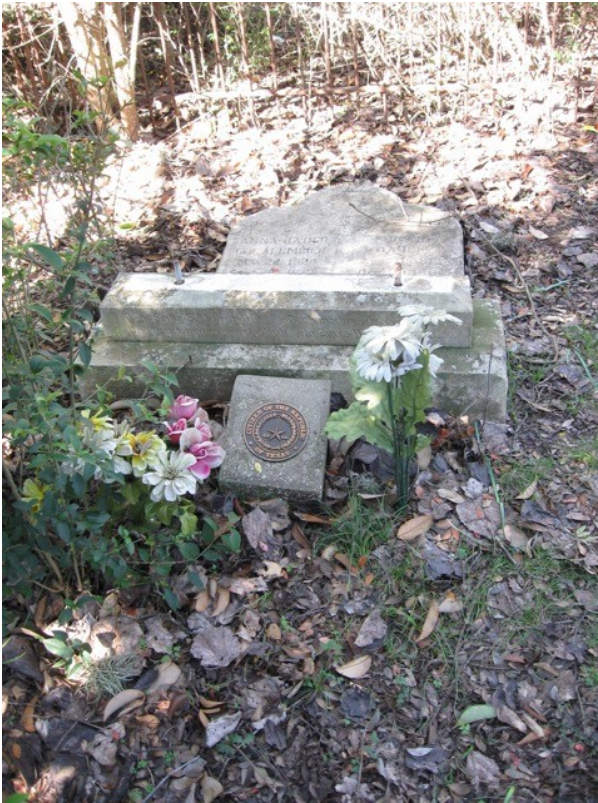
Photo of the cemetery taken in February 2017