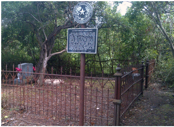
Jauer Family Cemetery after the restoration in June 2017