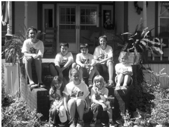
Cousins on the front steps of the 1873 Allen Homeplace

Homes have a genealogy, too, and some provide a place to sink deep roots. Built by my great grandfather, this house was my first home and the site of a family Cousin Camp in the summer of 2008. I hope others will find this useful as a guide to planning similar events. The history of the house itself follows.